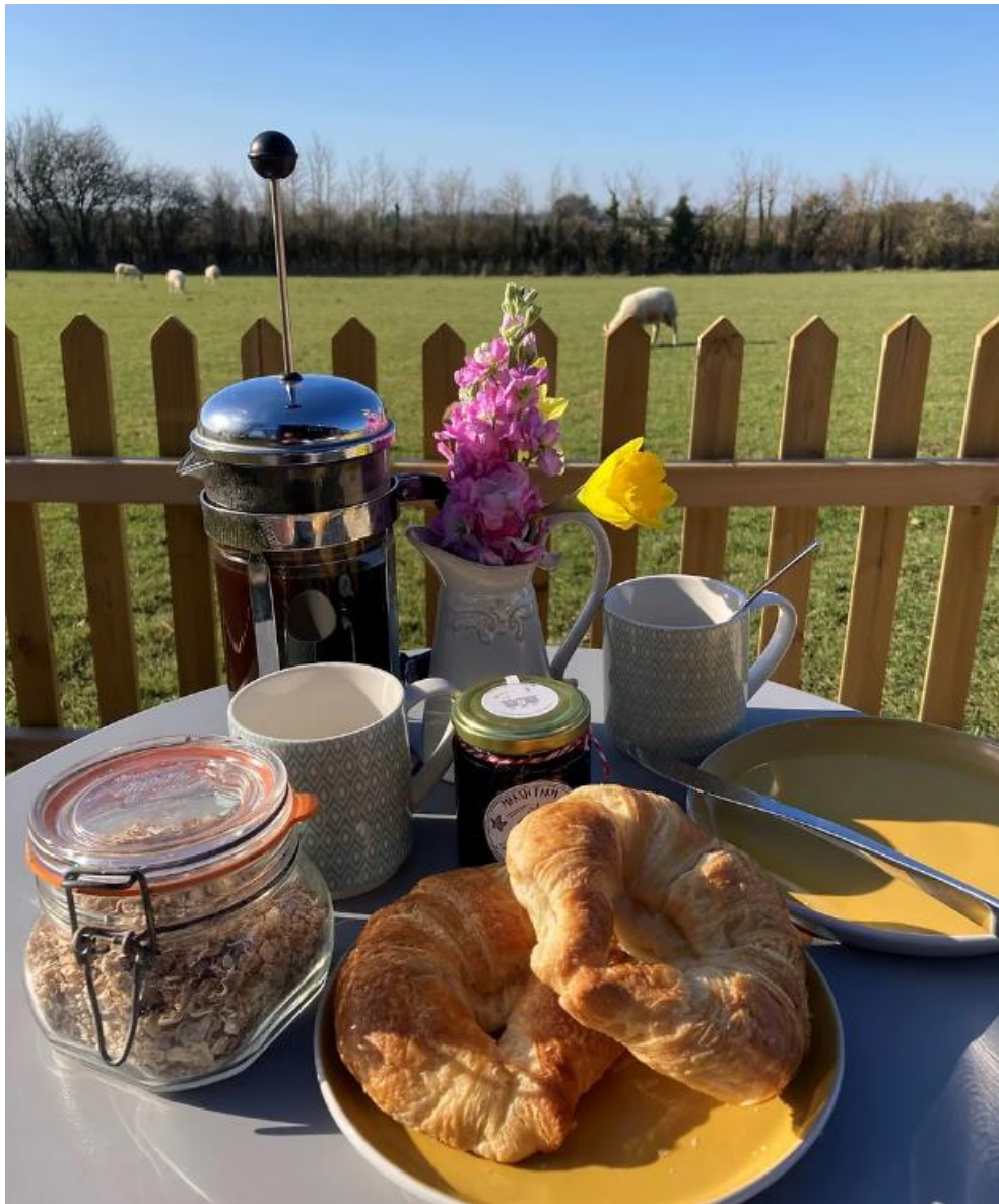
Munch on breakfast at Marsh Farm Glamping , whilst the sheep munch on theirs...