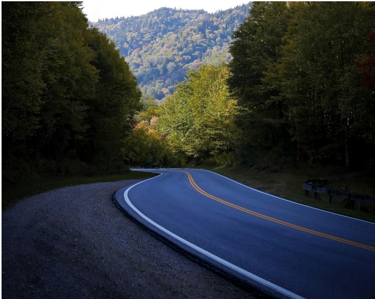
Imagine driving this route through the Smoky Mountains

Snaking through the Great Smoky Mountain National Park, and featuring eleven miles of spine-tingling bends, the Tail of the Dragon has obtained cult status worldwide. Not for the faint hearted, this ride, on Route 129, is one of the best in the USA. Showcasing a whopping 318 bends with names such as Gravity Cavity and Brake or Bust, the Tail attracts motorcyclists and supercar aficionados from around the world